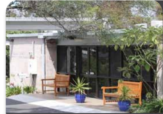
mecwacare Simon Price Centre, Mont Albert Accommodates 53 residents

There was a focus on occupancy at mecwacare O'Mara House in Traralgon (Gippsland), to ensure all available beds in the facility were occupied. This included several residents from a background of severe social and economic hardship who chose a 'tree change' – relocating to Traralgon from a recently closed specialised residential facility in North Melbourne. The implementation of a 'Men's Group' had male residents taking part in woodworking activities supported by lifestyle staff, building bird houses for the facility gardens, a highlight that included the assistance of resident family members. Improvements to IT systems and increased management support have made a strong impact on the connectivity of the facility with the rest of the organisation. A new backup power generator was purchased and installed from a state government Local Infrastructure Assistance Fund (LIAF) grant.