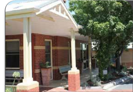
mecwacare Vincent House, Westmeadows Accommodates 30 residents

mecwacare May Noonan Centre in regional Western Victoria is located in an elevated position overlooking rolling hills and the township of Terang. In mecwacare 's first delivery of residential services in a truly rural area, we are forging a strong relationship with the local community. Steps have been taken to increase the clinical care staff/resident ratio in the facility. Able residents now hold nightly events for peers; cards, bingo and guitar are extremely popular. A new backup power generator was installed thanks to a state government Local Infrastructure Assistance Fund (LIAF) grant, and we are looking at options for a large parcel of land adjacent to the facility that was part of the facility purchase.