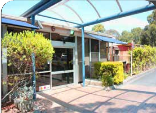
mecwacare Atchison Centre, Box Hill Accommodates 31 residents

In February 2016, mecwacare commenced ownership and management of an additional six residential aged care facilities, welcoming more than 300 new residents and 400 staff to the organisation. The new sites have not only expanded mecwacare 's residential services across Melbourne's Northern and Eastern suburbs, but also regionally with locations in Greater Geelong, Latrobe and Corangamite local government areas.