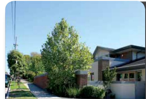
mecwacare Malvern Centre, Malvern Accommodates 100 residents

To increase the focus on clinical care at mecwacare Rositano House in Richmond, a new care coordinator staff position was established. The Wellbeing Clinic for Older Adults program continued with weekly counselling sessions, and monthly feedback was provided to ensure improved outcomes for residents in the program. Additions were made to the lifestyle program to better meet client interests. Formerly named mecwacare Richmond Hill, the facility was renamed mecwacare Rositano House to recognise a generous bequest from the estate of a long term volunteer at the facility. This bequest will contribute significantly to extensive renovations planned to commence in late 2016. These renovations will greatly enhance the living and work environments for our residents and staff. Access improvements will allow better freedom of movement for residents with mobility aides, and there will be upgrades to fire safety, nursing stations and nurse call systems for more efficient care delivery to residents.