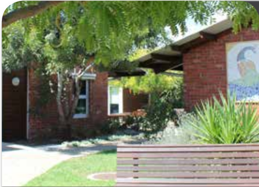
mecwacare Elstoft House, Hamlyn Heights Accommodates 91 residents

mecwacare warmly welcomes all new residents, staff and volunteers to the organisation through what has been the largest statement of regional growth in our history. Since acquiring the new facilities, mecwacare has implemented a range of clinical, lifestyle, equipment and building improvements to ensure each new facility aligns directly with the Purpose, Vision and Values of the organisation.