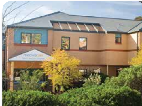
mecwacare Noel Miller Centre, Glen Iris Accommodates 138 residents

In the past year mecwacare's five established residential facilities in greater Melbourne and Mornington have undertaken a range of new initiatives built around improving the delivery of services and enhancing the daily care and lifestyle of residents. The clinical care and lifestyle needs of our residents remained the focus of staff and volunteers, while improvements were made to the buildings, equipment, furnishings and gardens of our centres.