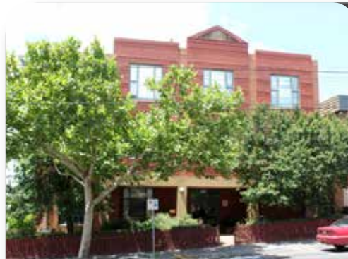
mecwacare Rositano House, Richmond Accommodates 30 residents

mecwacare Park Hill in Mornington received major upgrades to phone and nurse-call systems, significantly increasing system capability, reliability and the ability of staff to respond to residents requiring assistance. Residents took part in the Chicken Hatchery program in February. This provided residents and their families with the opportunity to watch the hatching and growth of chickens over two weeks. Everyone had the chance to hold, listen to and watch the chickens get up to mischief together, bringing back resident memories about growing up on farms or having backyard chickens as pets during childhood. Planning began for future building upgrades, and a Local Infrastructure Assistance Fund (LIAF) grant was received from the state government that will allow the purchase and installation of a new backup power generator late in 2016.