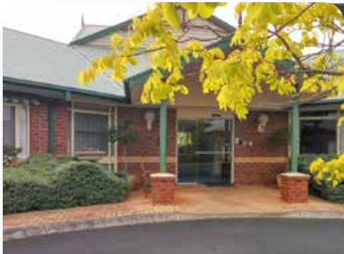
mecwacare Park Hill, Mornington Accommodates 69 residents

mecwacare Park Hill in Mornington received major upgrades to phone and nurse-call systems, significantly increasing system capability, reliability and the ability of staff to respond to residents requiring assistance. Residents took part in the Chicken Hatchery program in February. This provided residents and their families with the opportunity to watch the hatching and growth of chickens over two weeks. Everyone had the chance to hold, listen to and watch the chickens get up to mischief together, bringing back resident memories about growing up on farms or having backyard chickens as pets during childhood. Planning began for future building upgrades, and a Local Infrastructure Assistance Fund (LIAF) grant was received from the state government that will allow the purchase and installation of a new backup power generator late in 2016.