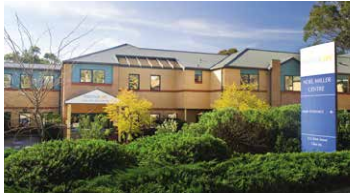
Pictured above: The mecwacare Noel Miller Centre, when it opened in 2003

With the completion of the project, 102 residents from MECWA House and The Olive Miller Nursing Home moved into the Noel Miller Centre in Malvern East in July 2003.