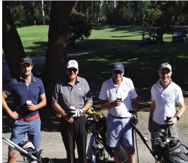
Pictured above: The winning team from Accru Melbourne