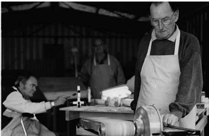
Pictured above: Tinkering away in the woodworking shed

To accommodate the increasing demand for services in Cardinia Shire, Rivendell House at 8 Henry Street, Pakenham, was purchased in 1999. A woodworking shed was added to meet the needs of a men's group who enjoyed the more active social aspects of the program.