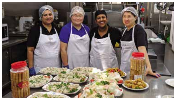
Pictured above: Simon Price Centre's award-winning Food Services Team. mecwacare provides services to more than 14,000 people across Victoria.