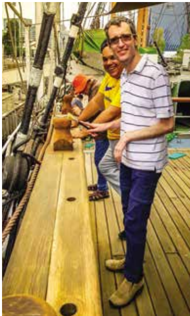
Pictured above: Fisher Street Centre participants helping to restore the Polly Woodside

This new weekly program has seen three participants join the maintenance crew in a volunteer capacity, with tasks including woodworking, cleaning and painting on board a ship steeped in history.