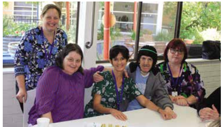
Pictured above: Staff and clients from Barry Fenton Centre celebrate the 20th anniversary in February 2019.

In 1998, the under-utilised Bowen Street Elderly Citizens Centre in Malvern East underwent extensive renovations, funded with the assistance of a $219,000 Department of Community Services grant, to provide services to a younger group of people with a disability. The facility, which included a clubroom for the Chadstone Senior Citizens Club to continue its activities, was officially opened in February 1999 and renamed the Barry Fenton Centre in 2017 after the long-time volunteer and mecwacare Life Governor.