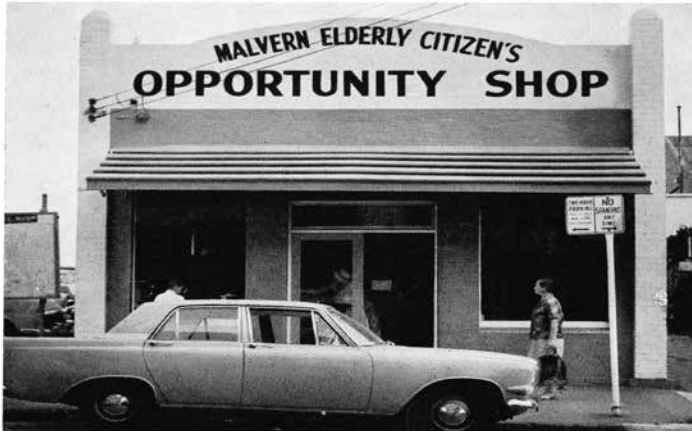
Pictured above: The original Malvern Op Shop, which still stands today

Malvern Op Shop – celebrates 55 years in 2019. This Wattleree Road shop was an immediate success, raising $1,000 in its first three and a half months. By 1967, annual gross earnings had topped $10,000, over 90 per cent of which was profit thanks to voluntary labour.