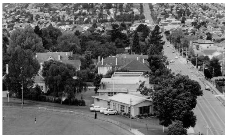
Pictured above: mecwacare's original site at the Malvern Cricket Ground

On the following page, read about how far we have come and some of our plans for the future.