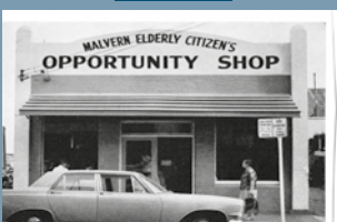
Commemorating our history