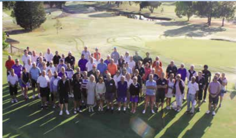
Pictured above: mecwacare Annual Charity Golf Day 2019 attendees

I am very proud of the high-quality, safe and respectful care we provide every day. We all work extremely hard to balance clinical care and lifestyle choices and are continuously looking at ways to do things better. I think it is worth noting that